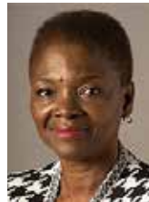
Baroness Valerie Amos CH Director of SOAS University of London

Ngee Ann Academy has similar aims. We are proud of these programmes and very excited to see how our graduating students will influence and shape the world we live in.”